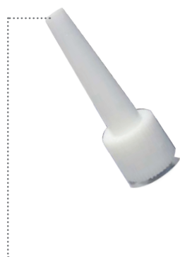
derma+flex fine applicator Allows fine applications where looks (cosmetic issues) are considered

derma+flex is ideally suited for areas of skin exposed to flexing and moisture, including between fingers and toes, fingertips, chins, eyebrows, elbows and knees, which are difficult to seal with traditional bandages.