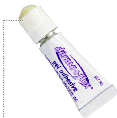
derma+flex foam applicator Allows a flow controlled application to the surface, that provides a flexible waterproof bandage